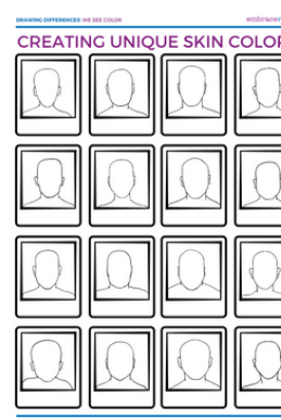
Activity Sheet 1.4) FIGURES Color Mixing Exploration