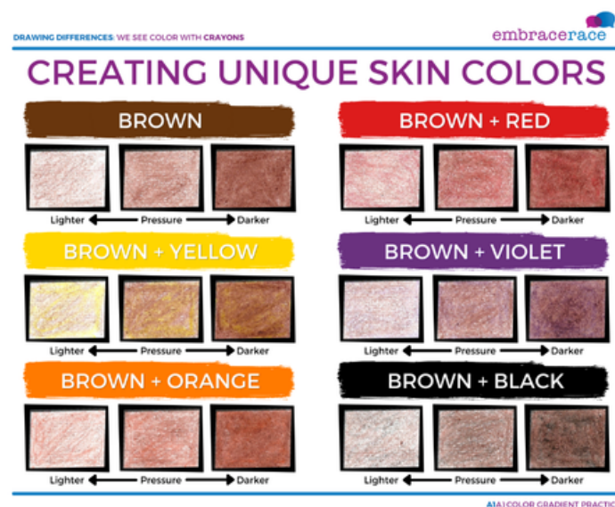
Activity Sheet 1.2) Color Gradient Practice: Crayons

Provide time for children to practice what you have just demonstrated with the brown color. Ask children if they have any questions and offer support as needed.