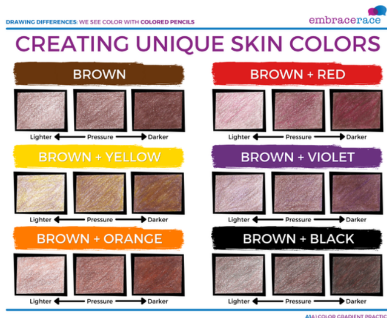
Activity Sheet 1.2) Color Gradient Practice: Colored Pencils

Depending on where children are in their learning (if you're working with a group), you may choose to continue to model and support their practice for the remaining color combinations, or you may decide that all or some children can now practice on their own.