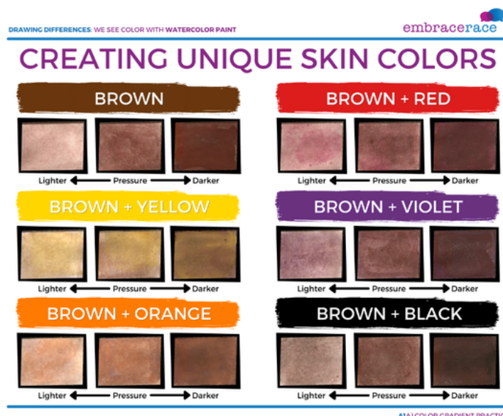
Activity Sheet 1.2) Color Gradient Practice: Watercolor Paint

Provide time for children to practice what you have just demonstrated with the brown color. Ask children if they have any questions and offer support as needed.